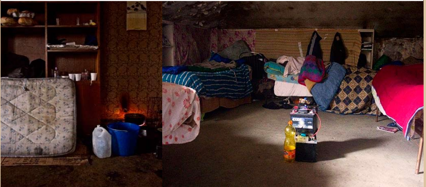
Below: interior of the rooms in the former Somali Embassy