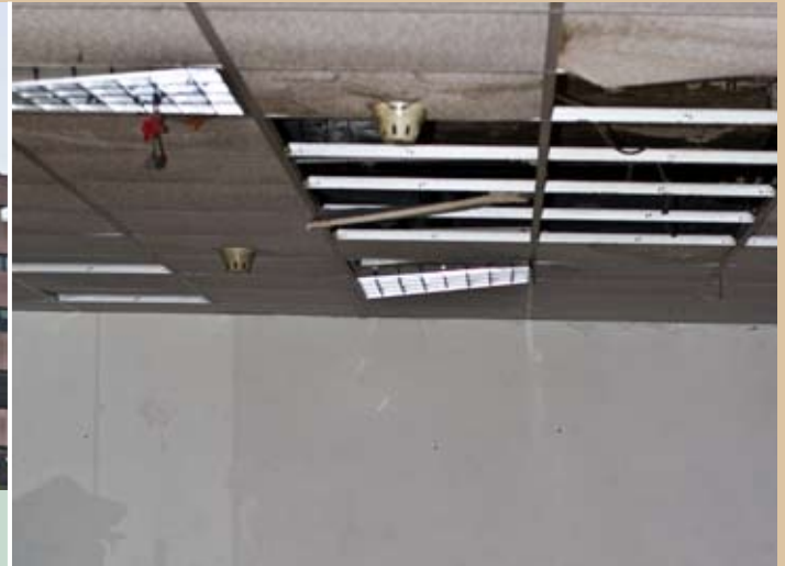
Kitchen in the occupied office block Anagnina