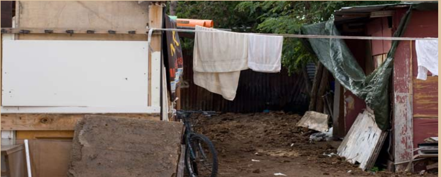
View of Comunità la Pace , also known as Ponte Mammolo , in Via delle Messi d'Oro in North East Rome

The annual statistics report of 2009 for SPRAR lists 17 places in the whole of Italy providing accommodation for people needing psychiatric treatment. 22 However, NGOs have told us that only five places actually exist and that the remainder are still in the planning stages. Regardless of whether there are five or 17 places available, at the time of research, as well as in response to a query in June 2010, all were full to capacity. Therefore, should a traumatized individual be returned under the Dublin II Regulation, for example, there would be no appropriate accommodation available.