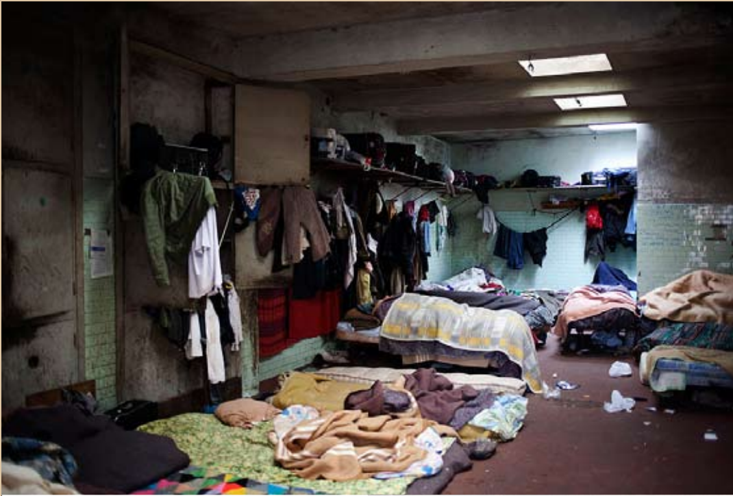
The garage of the former Somali Embassy, now the bed- and living room for about 50 people