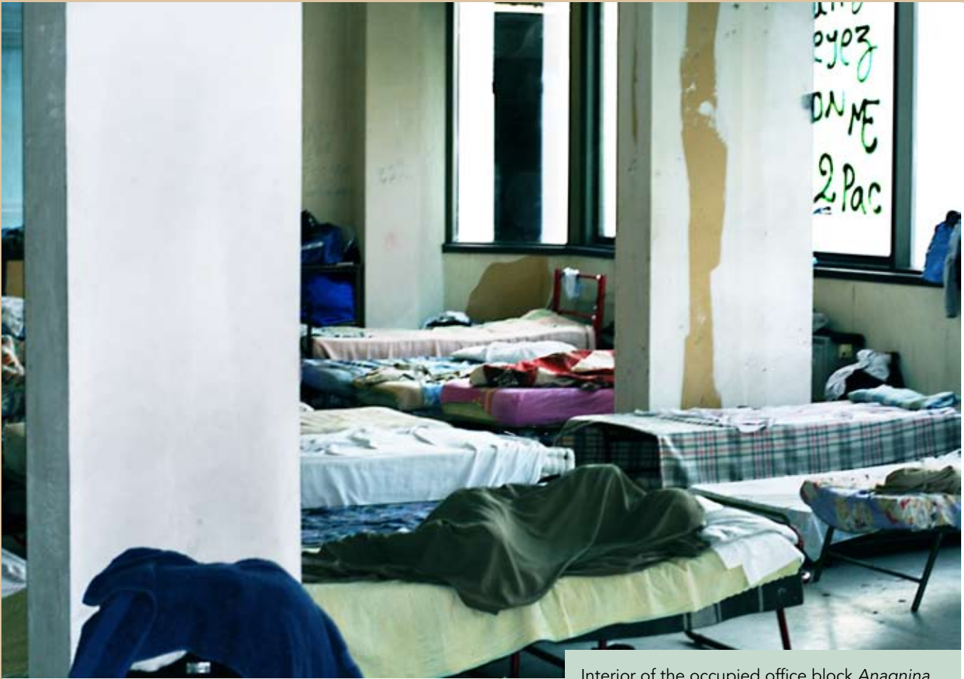
Interior of the occupied office block Anagnina

or persons with protection status, will fall to the number of places available through the SPRAR system. 7