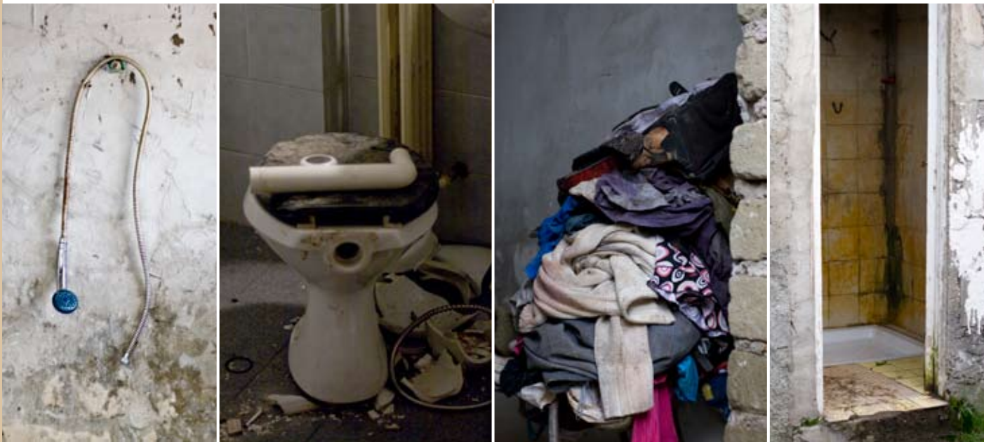
Views of the toilets and wash rooms in Comunità la Pace in Rome and Casa Bianca in Turin

Many of our interviewees described traumatic experiences in their countries of origin, during their journey and during their stay in Italy. Many described symptoms consistent with Post Traumatic Stress Disorder but none were receiving psychological or psychiatric treatment. Due to a lack of health insurance they had no access to such treatment and further did not live in the stable conditions necessary for therapy. Even those who had previously been diagnosed