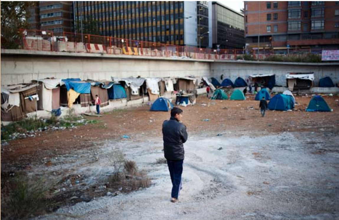
Refugee settlements near Ostiense station