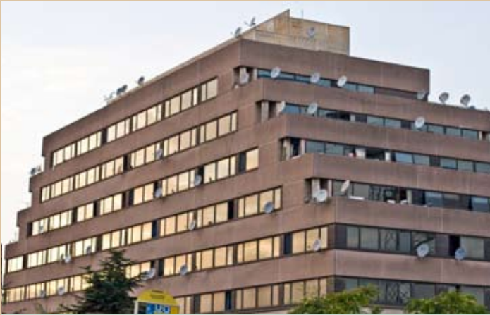
Above: view of the occupied office block in Via Collatina Below: the only toilet on a floor with approximately 250 residents