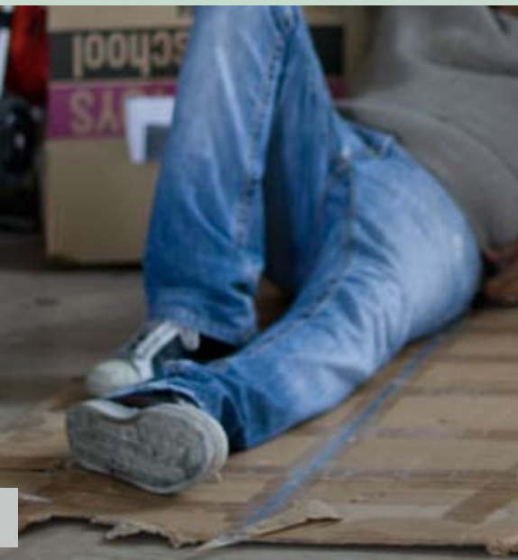
Improvised sleeping arrangements in the occupied office building Anagnina