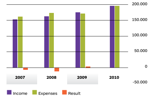
2010 Sources of income 2009 2010 Expenditure 2009